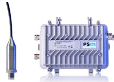
FUEL & LUB OIL LEVEL