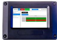
FLOOD DETECTION SYSTEM