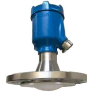
RADAR LEVEL CARGO TANKS